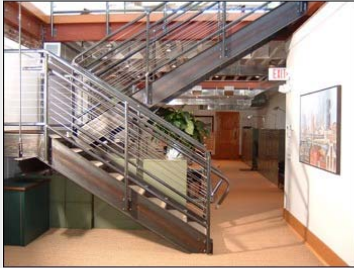
Before view of 2nd floor from back of building to front