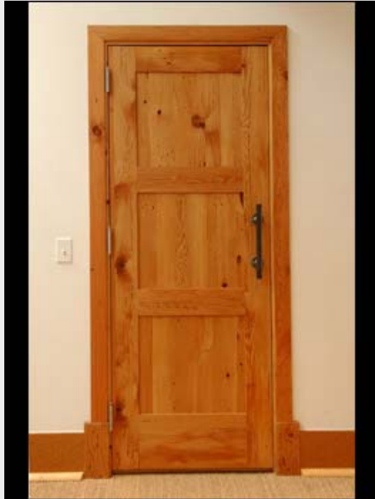
During view of erecting wall for mezzanine level office