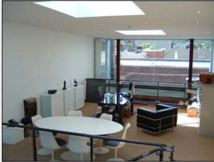
Finished view of staircase from 2nd fl to new mezzanine level, with view of skylight