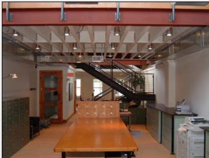
Finished view of mezzanine level office