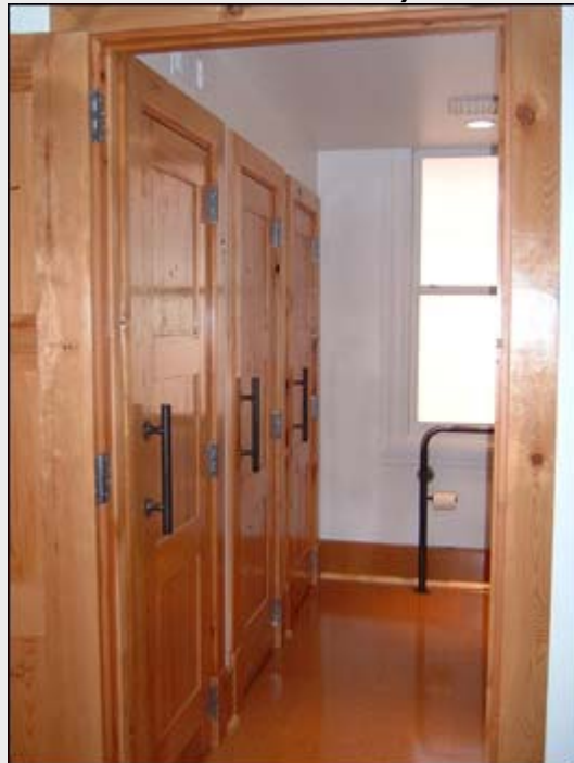
Finished view of custom door detail - doors & trim fabricated in our millwork facility from recycled framing lumber