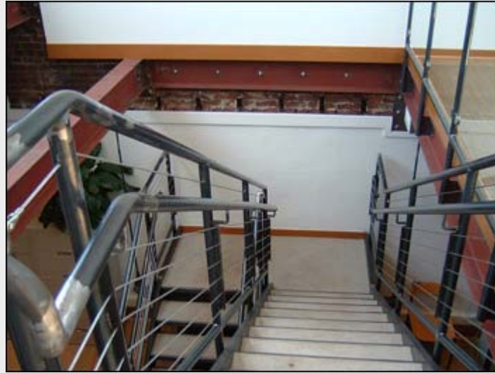
Before view of 2nd floor front office