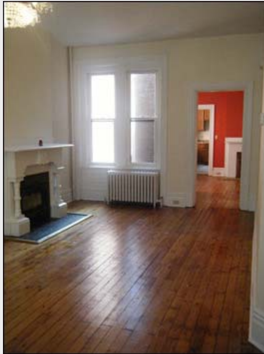
During Construction View

Universal Access: Whether to accommodate a chronic disability, an elderly relative, a temporary injury, the concept of universal or accessible design can be easily and affordably achieved in any bathroom remodel without sacrificing design or resale value. Multiple-height vanities, lever-handled faucets, D- shaped cabinet pulls, and zero-threshold showers with built-in seating and handheld heads are just a few design and product ideas that support universal design and are easily accommodated in a bathroom remodel or