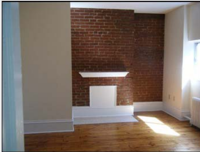
During Construction View