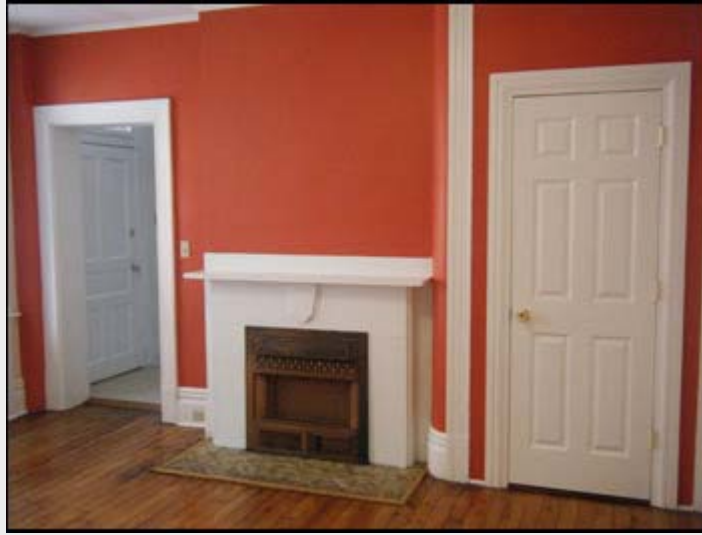
Before Construction View

Personal Service: As people remodel their homes, the master bathroom has become a destination. As such, it needs additional conveniences, including laundry and clothes storage as well as a place to prepare snacks and