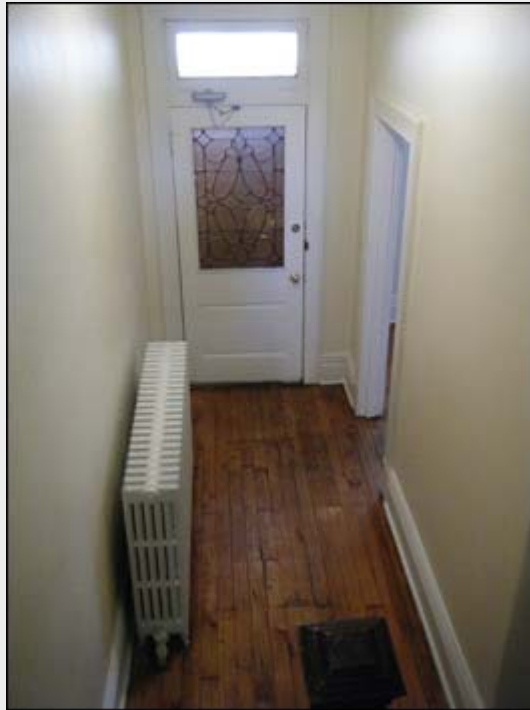
During Construction View

At J. Francis Company, first we build the relationship and trust. Then we build quality projects, on-time and on-budget. We recognize that the success of your remodeling project is based upon what you have experienced during the process.