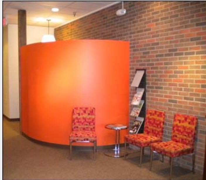
Before Construction View