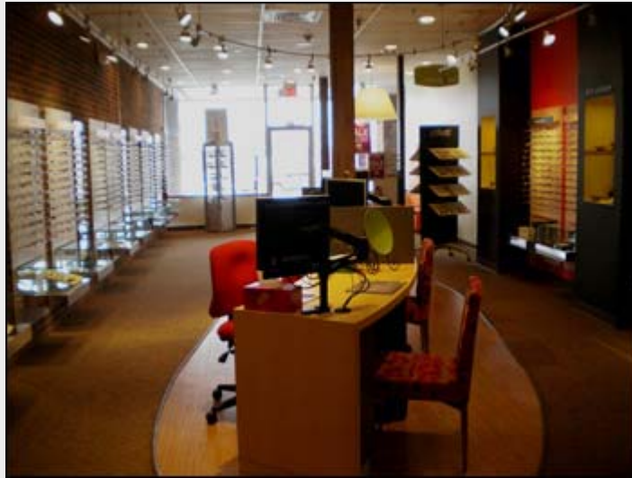
Before Construction View

J. Francis Company's staff is available to consult with you on these and other roof conditions. We can complete an estimate for you to submit to your insurance company, and then