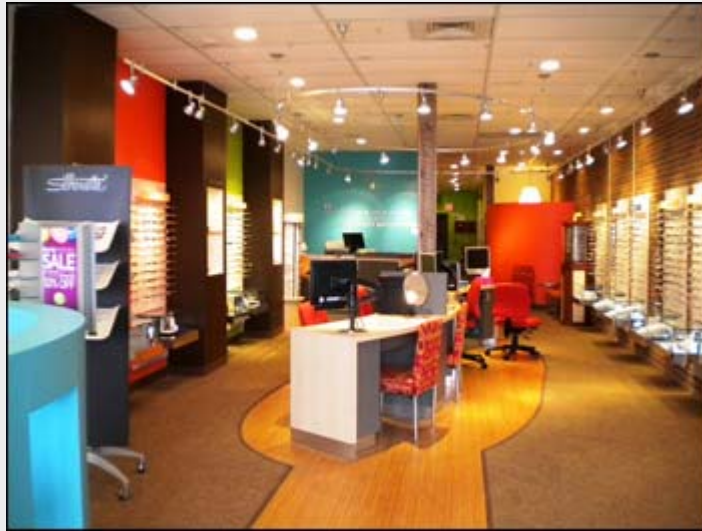
Before Construction View

Jean orchestrated a delicate dance of hundreds of moving parts, which allowed me to continue seeing patients as the