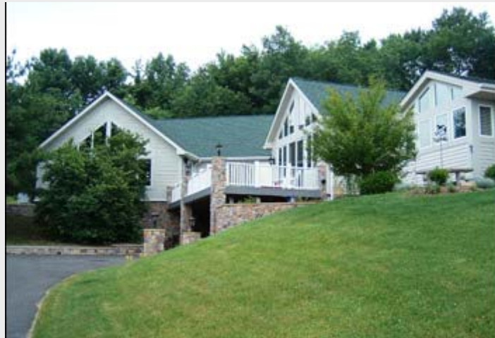
During Construction View