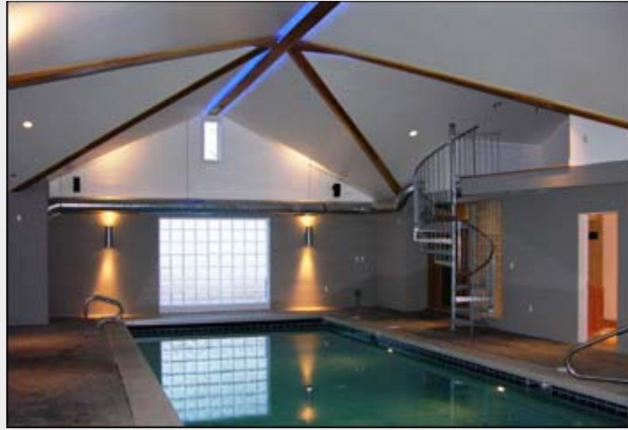
During Construction View

Excessive rain can bring out unwelcome guests such as termites, carpenter ants, fleas and bees. All insects need moisture to survive. Carpenter ants, for example, never nest in healthy dry wood. They will seek out a windowsill that has been damp from a leak, or an area near a water pipe that leaks and will start a nest there. Termites will eat most hardwoods, but they must have moisture and will locate their nest near an available source. Eliminating one of those elements will help control annoying pest infestations. Here are some tips to help control the pest problem in and around your home: