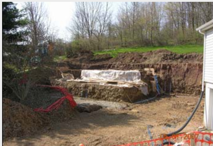
During Construction View